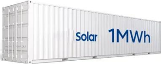
Standard 40ft containers

In order to improve the energy efficiency of the base station, energy is collected from renewable resources (wind and solar energy), and traditional energy consumption is reduced without ...