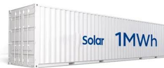
Standard 40ft containers