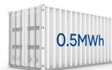
Standard 20ft containers