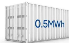
Standard 20ft containers