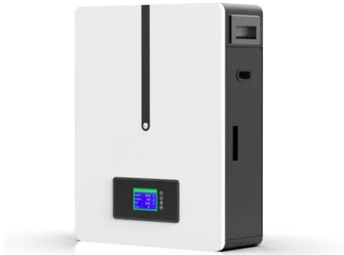
ABB Inverter units 45kW ACS880-104-0078A-5

Get a Quote Today - Fast Shipping ! 30-Day Return Guarantee / ABB Inverter units 45kW ACS880-104-0078A-5 ACS880-104-0078A-5 PN: 45kW, IN: 78A ABB Manufacturer ...